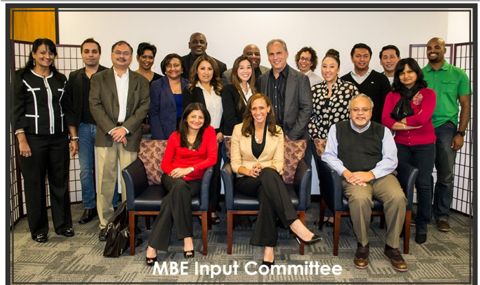
MBE Input Committee

➡ WRMSDC Annual Sponsors - Wells Fargo, Pacific Gas and Electric Company, Comcast, and MGM Resorts International – are among the 17 "Stalwarts of Diversity" since 2005. Also on the list are MUFG Union Bank, N.A. and AT&T . See the full list here.